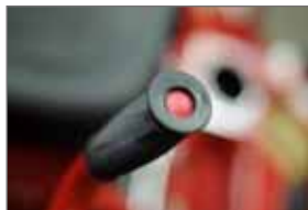
Electric spray system in handle