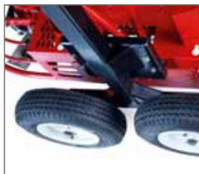
Transport wheels 'Dolly jacks'