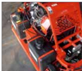
Two water tanks