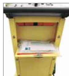
Document and tool box