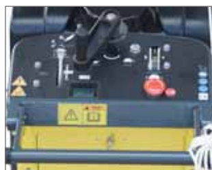
Advanced control panel with hour meter