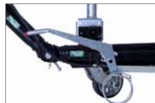
Hand brake and height adjustment