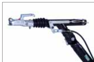
Option : tow brakes