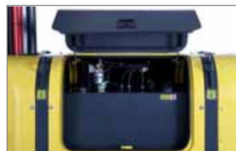
Service hood, carbon components to reduce weight