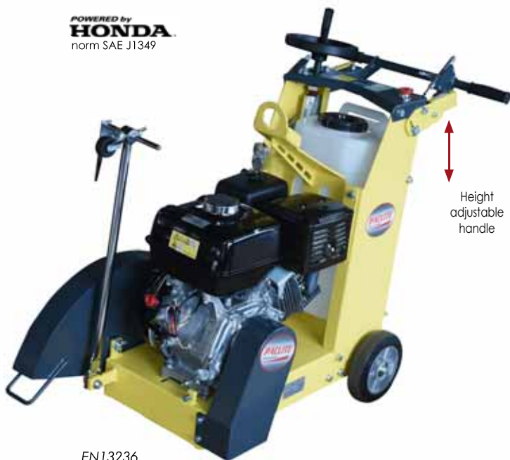
Height adjustable handle