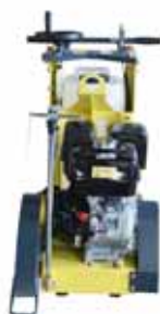
Water tank 25 L