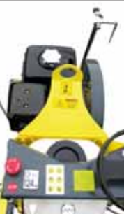
Central lifting point