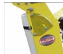
Max blade diameter 450 mm