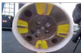
Option: set of four diamond segments