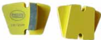
Standard segments concrete