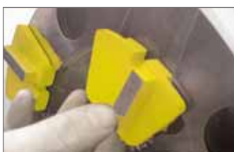
Diamond segments easy to change, without any tools needed